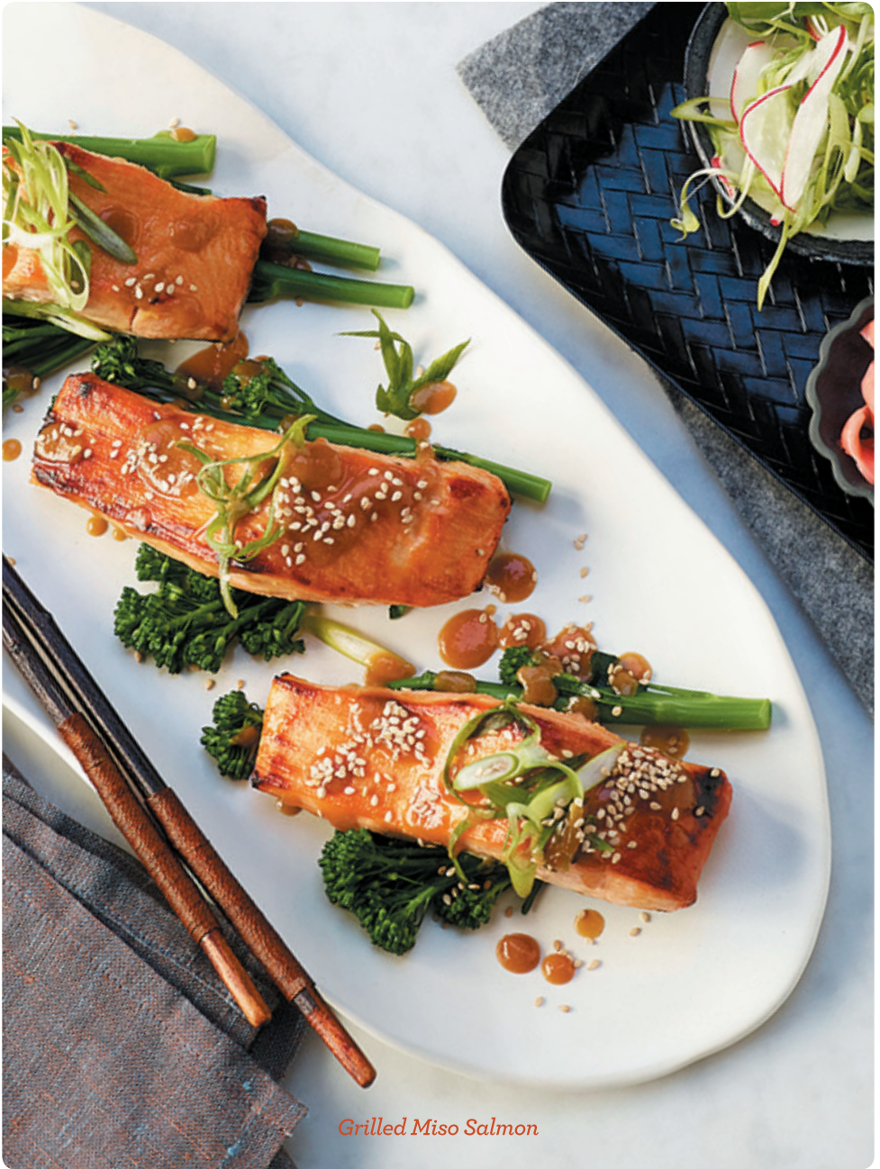
Grilled Miso Salmon